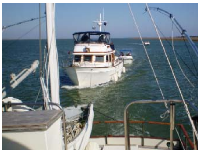
The Returning Fleet with Two in Tow