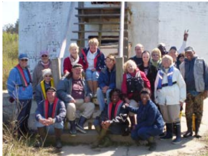
The Squadron Group at the Lighthouse