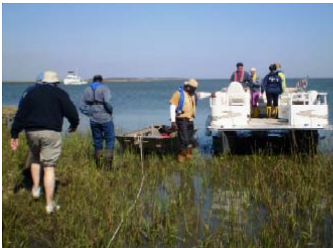
Boarding the Daisy Bell for the Return Ride to the Anchored Fleet