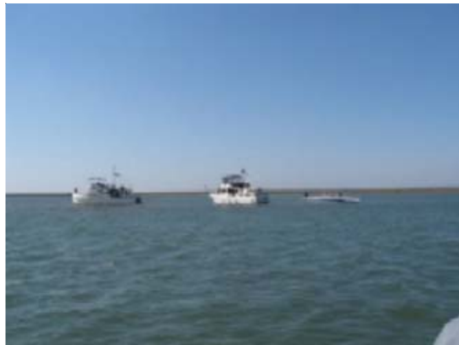
Distant Isle, Molly Brown, Fountain